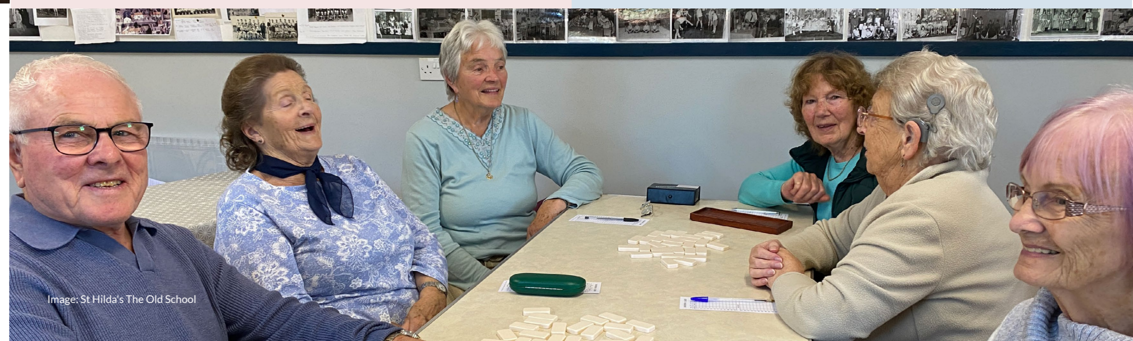
Image: St Hilda's The Old School